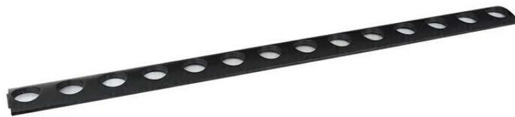
Optional Diffusers – 20 deg & 40 Deg